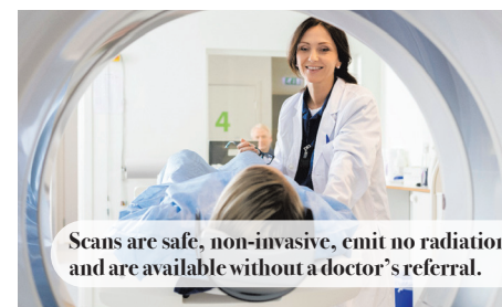
Scans are safe, non-invasive, emit no radiation and are available without a doctor's referral.

• Immediate Answers: Don't wait for a crisis to find out what's going on inside your body.